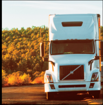
TRUCKS AND TRAILERS