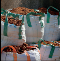
BAGS AND CONTAINERS