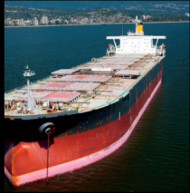
SHIPS AND BARGES